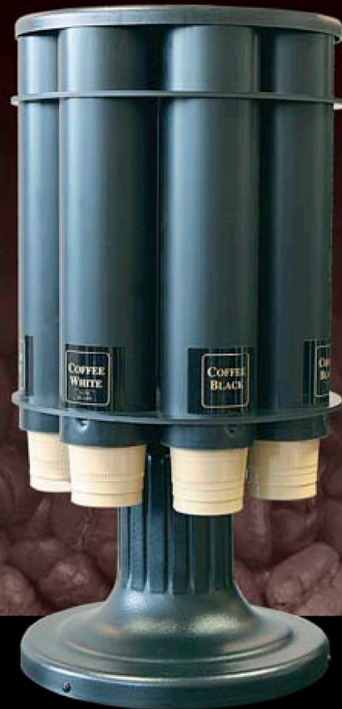
Standard Mini Carousel