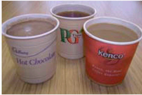
Both machines allow users to enjoy delicious in-cup drinks

The Carousel is available in a range of graphics and branding options. Please ask your DarenthMJS authorised dealer for latest details.