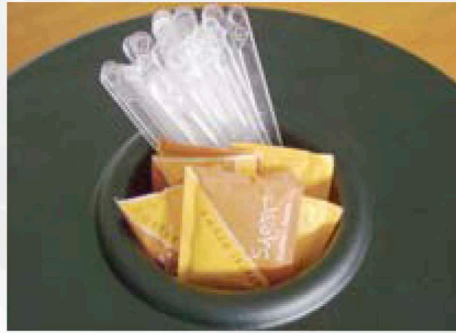
Handy storage compartment on Mini Carousel, ideal for sugar sachets

The Carousel and Mini Carousel by DarenthMJS are two delightfully simple pieces of equipment, ideal to provide users with an introduction to the ultimate convenience of in-cup products.